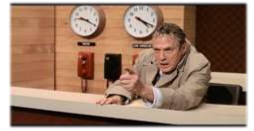
Peter Finch plays News Anchor Howard Beale - Click to Watch

NETWORK brought Oscars to Chayefsky for original screenplay, Dunaway for lead actress & Beatrice Straight for