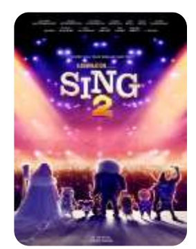
Sing 2 (Universal) 12/22/21 - Wide Trailer #2, Poster