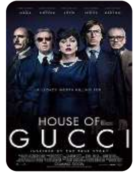
House of Gucci (UA Releasing) 11/24/21 - Wide Final Trailer, Poster