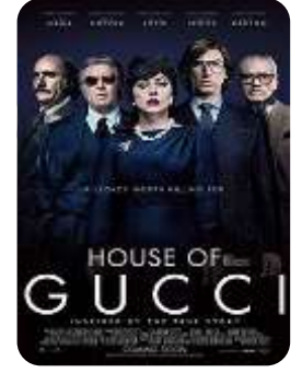
House of Gucci (UA Releasing) 11/24/21 - Wide Final Trailer, Poster