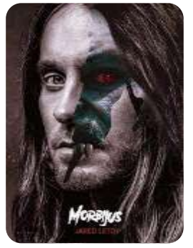
Morbius (Sony/Columbia/Marvel) 1/28/22 - Wide Final Trailer, Poster