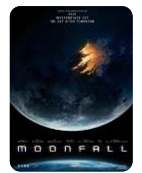
Moonfall (Lionsgate) 2/4/22- Wide Official Trailer, Poster