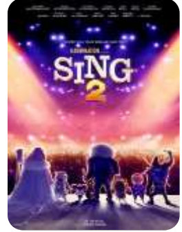
Sing 2 (Universal) 12/22/21 - Wide Trailer #2, Poster

Screendollars · contactus@screendollars.com · (978) 494-4150