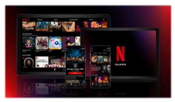
Netflix Games are available on Android Smartphones and Tablets, with additional support for Apple/IOS coming soon

Earlier this week, Netflix stated that it now offers its new gaming service in over 190 countries, including the U.S. and Canada. For the time being, Netflix games are only available on Android smartphones and tablets, though IOS versions will also roll out over the next several months. At this time, Netflix offers only a limited number of games played using touch controls on the mobile device. Gaming controllers are not yet supported, further limiting the variety of games and gaming experiences. Any user with a valid Netflix subscription can play without additional charge and there are advertisements or additional costs for in-app purchases. Last July, Netflix announced its intention to enter the online gaming market, starting with games for mobile devices.