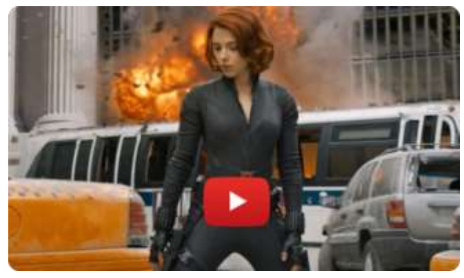
Click to play our POPCORN PREVIEWS BOX OFFICE BUZZ... looking at some of those marvelous Marvel movie moments we've been missing at the box office for too many months. In Part 1 of our four-part series recalling two dozen Marvel memories, we start with a look at 2012's THE AVENGERS.