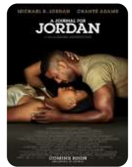
A Journal for Jordan (Sony/Columbia) 12/25/21 - Wide New Trailer