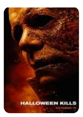
Halloween Kills (Universal) 10/15/21 - Wide Trailer #2