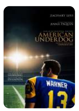
American Underdog (Lionsgate) 12/25/21 - Wide Official Trailer