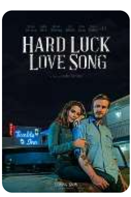
Hard Luck Love Song (Roadside Attractions) 10/15/21 - Limited Official Trailer