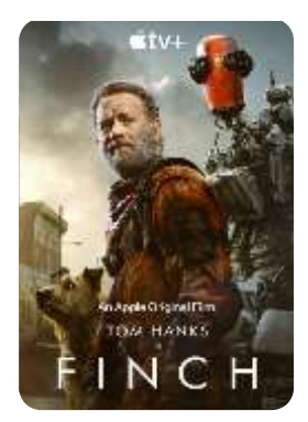
Finch (AKA: Bios) (Apple TV+) 11/5/21 - Select Theatrical/ Streaming Official Trailer