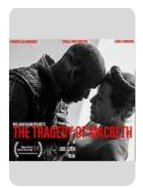
The Tragedy of Macbeth (A24) 12/25/21- Limited 1/14/22 - Apple TV+ Official Trailer