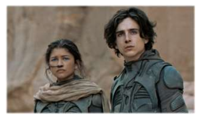
Warner Bros.' Dune will open in China on 10/22

After a strong opening for Dune in other international markets, China announced this week that the Warner Bros. sci-fi hit would get a theatrical run in China as well, opening on October 22nd.