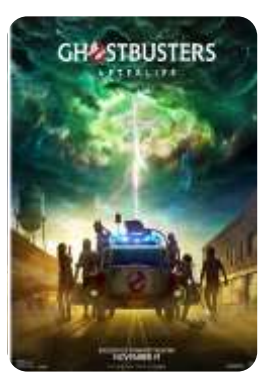
Ghostbusters: Afterlife (Sony) 11/19/21 - Wide Official Trailer, New Poster