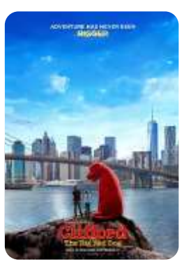
Clifford: The Big Red Dog (Paramount) 11/10/21 - Wide Teaser Trailer with previous release date