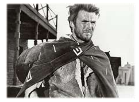
"Get three coffins ready." - Click to Play

The trilogy's success put Eastwood on the map, but he wasn't the first choice for the role. Leone wanted Henry Fonda, but