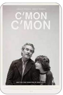
C'mon, C'mon (A24) Release Date TBA Trailer #1