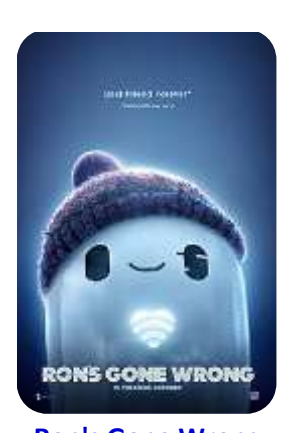
Ron's Gone Wrong (20th Century Studios) PG 10/22/21 - Wide Trailer #2