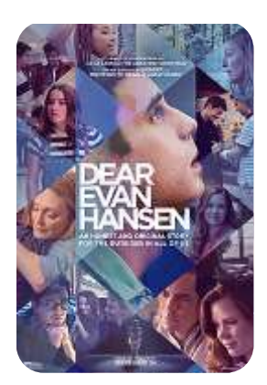
Dear Evan Hansen (Universal) PG13-137-Scope 9/24/21 - Wide Final Trailer, New Poster