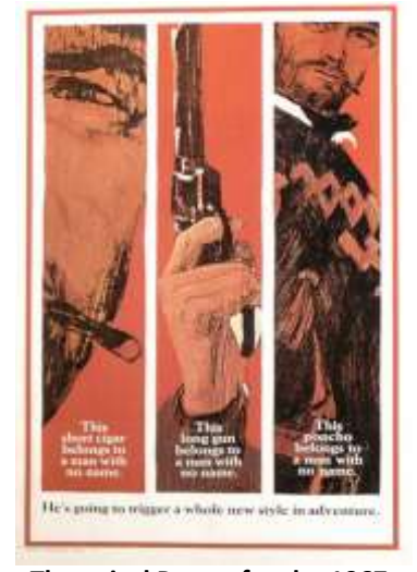
Theatrical Poster for the 1967 U.S. release of Sergio Leone's A FISTFULL OF DOLLARS

UA's ad campaign worked very well. DOLLARS grossed $14.5 million. That was good business at the time, especially since Leone reportedly made it for just $200,000 and only paid Eastwood $15,000. MORE grossed $15 million after opening May 10, 1967. UGLY arrived Dec. 29, 1967 and did much more than MORE -- $25.1 million.