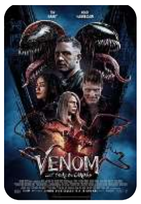
Venom: Let There Be Carnage (Sony/Marvel) R-90-Scope Wide - 10/1/21 Latest Trailer, New Poster