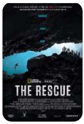
The Rescue (Greenwich Entertainment/ National Geographic) NR-114-Scope 10/8/21 - Limited 10/15/21 Expansion Official Trailer