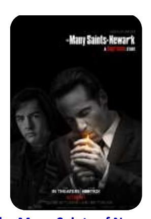
The Many Saints of Newark (Warner Bros.)

(Warner Bros.) 12/22/21 - Wide Official Trailer #1