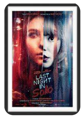
Last Night in Soho (Focus Features) 116-Scope 10/29/21 Trailer #2