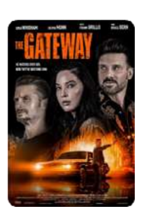
9/3/21 - Select/VOD Official Trailer A down-on-his-luck social worker finds himself in over his head when he tries to protect a client from her recently paroled husband -- a maniacal drug dealer out to reclaim his priceless stash.