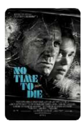
No Time To Die MGM/Universal/UAR 10/8/21 - Wide Final Trailer

A con artist decides to hide from an assassin inside a small-town police station. When the hit man turns up at the precinct, an unsuspecting rookie cop finds herself caught in the crosshairs. Joe Carnahan-D (Smokin' Aces, Point Blank, Death Wish, Bad Boys For Life, The A-Team, El Chicano.