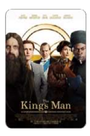
The King's Man 20th Century/Disney 12/22/21 -Wide

Recruited to rescue a kidnapped scientist, globe-trotting spy James Bond finds himself hot on the trail of a mysterious villain, who's armed with a dangerous new technology. One of the best trailers of the year.