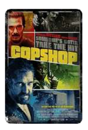
Copshop Briarcliff/Open Road 9/17/21 - Wide