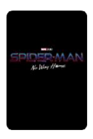
Spider-Man: No Way Home (Sony/Marvel) Wide - 12/17/21 Official Trailer The new trailer shown at Cinema Con and online has been tremendously well received. The film has been one of the most highly anticipated films of the year.