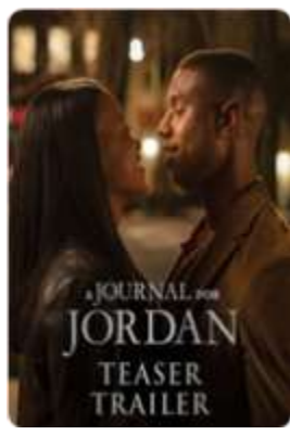
A Journal for Jordan (Sony/Columbia) 12/10/21 – NY/LA 12/22/21 – Wide Exp.

Two creative forces band together to make a documentary about St. Vincent's music and life. However, they soon discover unpredictable forces lurking within subject and filmmaker that threatens to derail their friendship and the project.