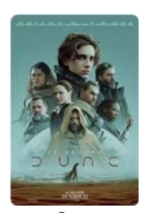
Dune (Warner Bros.) 10/22/21 – Wide Newest Trailer

Led by one of the most comprehensive marketing campaigns in movie history, Dune's mind blowing spectacular visuals, Hans Zimmer's soundtrack and story combine to bring the beloved science fiction novel to life as never before. Directed by Denis Veilleneuve (Arrival, $100M domestic box office) there is no question this is the movie like no other this fall.