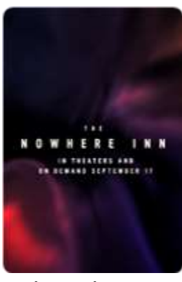
The Nowhere Inn (IFC Films) 9/17/21 – Limited Official Trailer

Led by one of the most comprehensive marketing campaigns in movie history, Dune's mind blowing spectacular visuals, Hans Zimmer's soundtrack and story combine to bring the beloved science fiction novel to life as never before. Directed by Denis Veilleneuve (Arrival, $100M domestic box office) there is no question this is the movie like no other this fall.