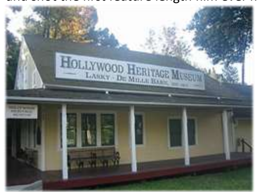
Lasky-DeMille Barn - Filming Location for DeMille's THE SQUAW MAN (1914) - <u>Click to Play</u>

DeMille, who was in charge of making the film, and Farnum set out by train for Flagstaff, Arizona. Flagstaff had sounded like the perfect location, but when they got there, they saw absolutely nothing. So, they got back on the train and stayed on till the end of the line -- a small town near L.A. called Hollywood where they rented a barn for $200 a week and shot the first feature length film ever made there.