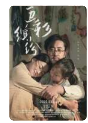
Confetti (DADA Films) 8/13/21 - Limited Official Trailer

Screendollars · contactus@screendollars.com · (978) 494-4150