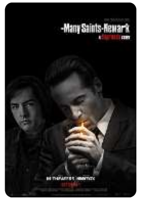
The Many Saints of Newark (Warner Bros./HBOMax) 10/1/21 - Wide Trailer #1

G.I Joe: Snake Eyes (Paramount) 7/23/21 - Wide Official Trailer