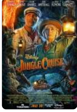
Jungle Cruise (Disney) 7/30/21 - Wide Final Trailer