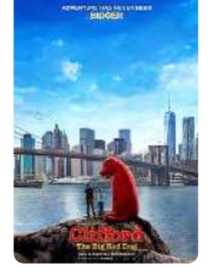
Clifford the Big Red Dog (Paramount) 9/17/21 – Wide Official Trailer