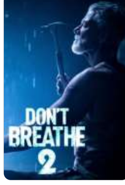
Don't Breathe 2 (Sony/Screen Gems) 8/13/21 – Wide Official Trailer