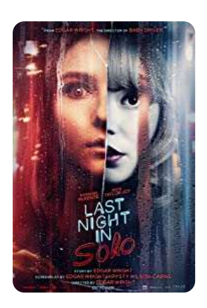
Last Night in Soho (Focus Features) 10/22/21 - Wide Official Teaser