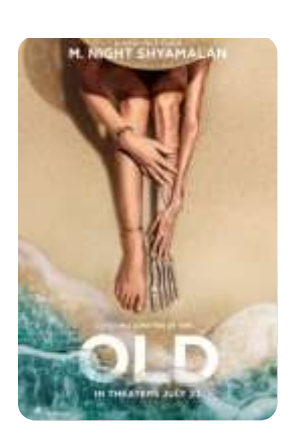
Old (Universal) 7/23/21 – Wide Official Trailer