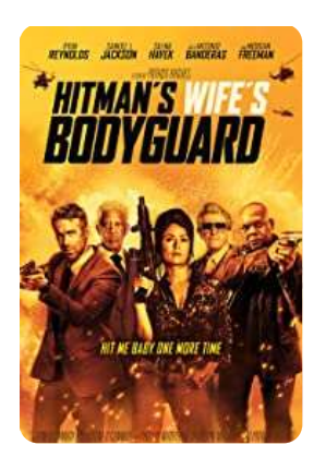
The Hitman's Wife's Bodyguard (Lionsgate) 6/16/21 - Wide Final Trailer