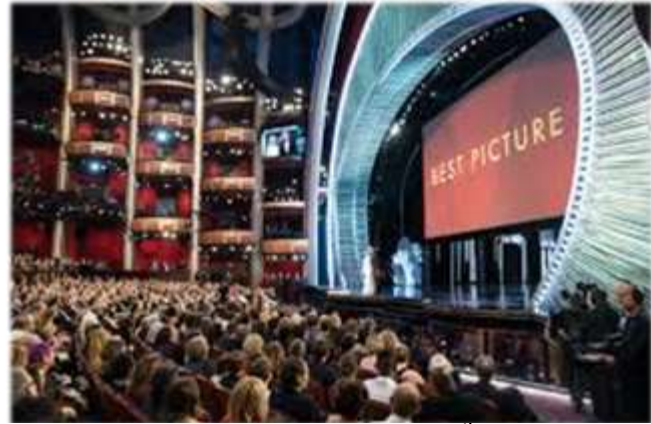
The Dolby Theatre will once again host the 94<sup>th</sup> Academy Awards

Whereas the modified and delayed Oscars from 2021 were a poignant reminder of the hobbled state of theatrical releasing during the pandemic, next year's event is shaping up to be a return to normal, hopefully with improved ratings.