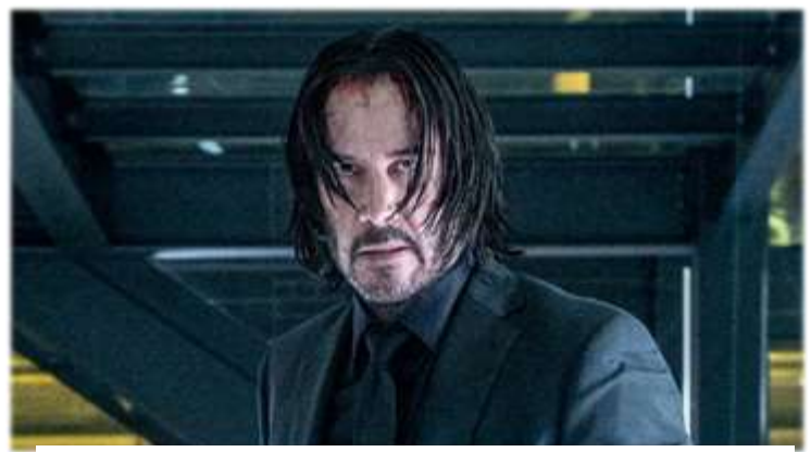
John Wick is one of Lionsgate's most popular movie franchises

The recent flurry of mergers and acquisitions among the top-tier of Hollywood studios, have industry watchers speculating that the few remaining mid-size studios such as Lionsgate will be the next targets for consolidation. Lionsgate has many traits that make it appealing, including its strength in streaming with Starz to its ownership of lucrative franchises such as John Wick and The Hunger Games . The post-pandemic return of exhibition should also strengthen its balance sheet, and value. Lionsgate has already shown success in theatres this spring, with successful May 13<sup>th</sup> release of Spiral and optimism for the June 12<sup>th</sup> release of The Hitman's Wife's Bodyquard .