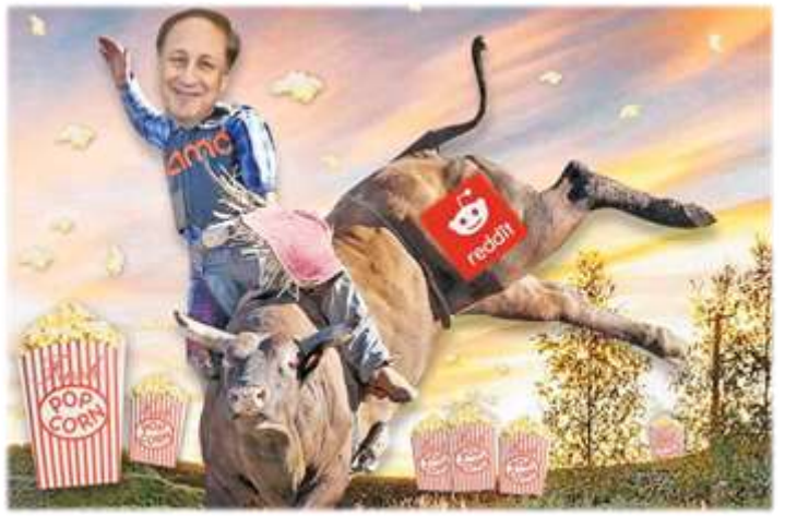
AMC's CEO Adam Aron

The Reddit Rallyers are at it again! This week, shares in AMC Theatres shot up, and down, and back up again on another wild ride fueled by day traders who follow Reddit's WallStreeetBets investment forum, which traffics in hot stock tips. In fact, on Friday AMC was the most heavily traded stock on the New York Stock exchange, with over 650 million shares changing hands, more than six times its average monthly trading volume of 106 million. The price of AMC shares has increased by 1,132% during the five months of 2021, as investors seek to capitalize on prospects for a resurgence of revenues at the world's largest exhibitor. This hyperactive trading and stock price fluctuations are also driven by dynamics that are endemic to rapid trading cycles, and not necessarily based on a clear-eyed assessment of the long-term