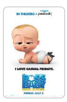
The Boss Baby: Family Business (Universal) 7/2/21 – Wide/Peacock TV (SVOD for 60 days) Official Trailer