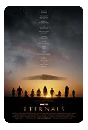
Eternals (Disney/Marvel) 11/5/21 - Wide Teaser Trailer #1