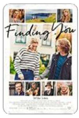
Finding You (Roadside Attractions) Opens 5/14/21 Featurette