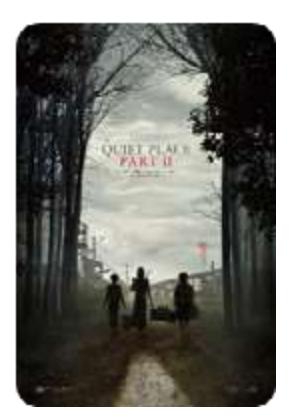
A Quiet Place Part II (Paramount) Opens 5/28/21 Final Trailer