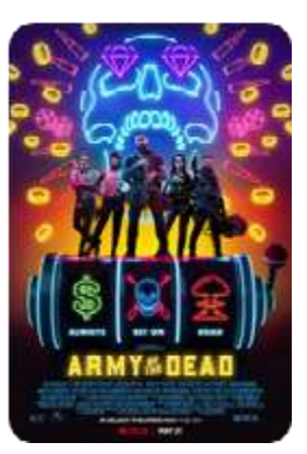
Army of the Dead (Netflix) Opens 5/21/21 Official Trailer