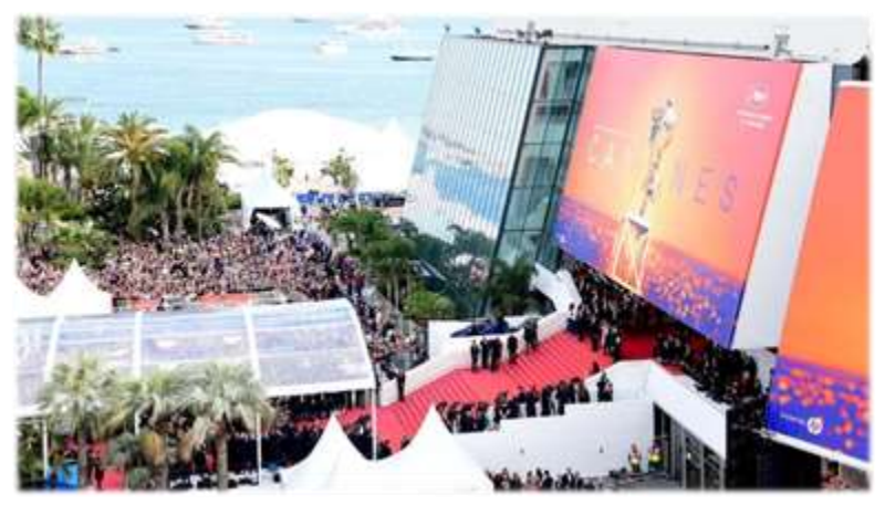
Crowds Waiting for Star Appearances at the Red Carpet at Cannes

France Widens Lockdown Restrictions Across Country Through May 2; Cultural Venues Could Begin Reopening Mid-May (Deadline) While the Chinese and now US exhibition markets are showing signs of a rebound, cinemas in Europe have continued to struggle under the weight of a persistent COVID crisis on the continent. Relatively high infection rates coupled with a slower-than-expected vaccination rollout have caused France - the Continent's largest theatrical market - to reimpose beginning April 2<sup>nd</sup> and lasting at least four weeks. In last week's announcement of the new restrictions, French President Emmanuel Macron announced that he expected "cultural venues"