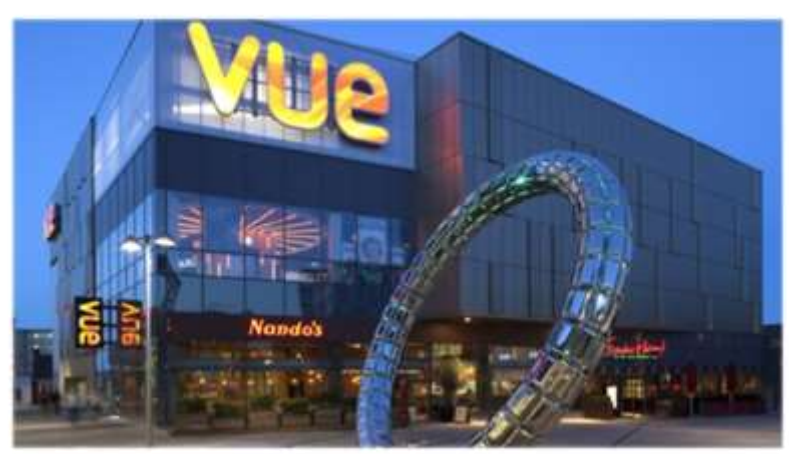
London-based Vue Cinemas operate over 200 theatres throughout the UK and the European Continent

See also: The Six Best Indie Movies to Watch Out for This Year (The Atlantic)