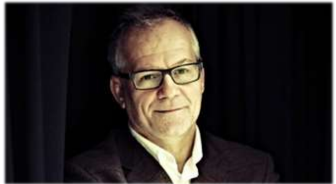
Thierry Frémaux, Director of the Cannes Film Festival

125 years ago, on 12/28/1895, the Lumiere Brothers conducted the first-ever commercial movie screening in Paris, using their camera/projector the cinematographe . To mark the anniversary, the director of the Cannes Film Festival Thierry Fremaux offered a guest column to Variety Magazine, looking back at the invention of movie going and forward to its post-pandemic future. The 125 year history of exhibition proves that going to the movies is fundamental to our nature, merging our desire to be entertained with our need to be social.