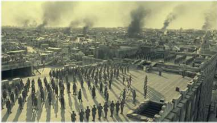
THE EIGHT HUNDRED (Huayi Brothers) earned $440M in 2020 box office