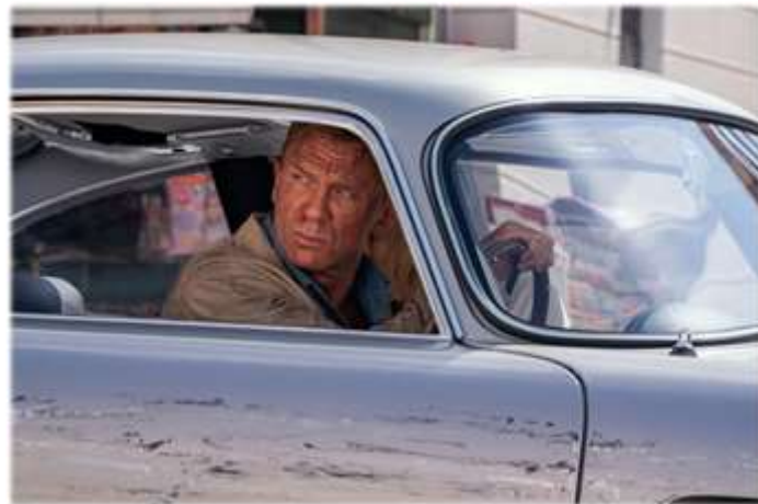
Daniel Craig stars as James Bond in No Time to Die , Opening 4/2/21

office over the past 47 years. What was once unthinkable – a Hollywood blockbuster postponing its release only four weeks before opening weekend – became commonplace throughout the year as studios scrambled to find a safe harbor for their films in the storm of 2020.