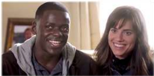
(Click to Play)

retelling of a similar story from a much darker perspective. While the film industry may still have a long ways to go, significant progress has been made in seeking out more diverse contributors to tell stories from a wider range of perspectives. This week, the New York Film Critics announced the winners of their 2020 NYFCC Awards which include Best Actor Delroy Lindo and Best Supporting Actor Chadwick Bozeman from Spike Lee's Da 5 Bloods .