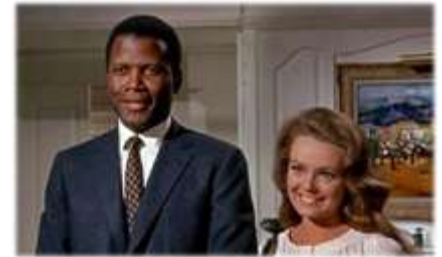
(Click to Play)

53 years ago on December 12, 1967, Columbia Pictures released Guess Who's Coming to Dinner , which tells the story of a family's reaction to a proposed marriage between a black man and a white woman. It starred Academy Award winners Sidney Poitier, Spencer Tracy and Katharine Hepburn and was produced and directed by Stanley Kramer, who was deft in his use of comedy to defuse the explosive potential of its subject. When the film was made, the Civil Rights Act of 1964 had been newly enacted and America was only beginning to reckon with the implications of becoming a color-blind society. 50 years later, Jordan Peele released his highly acclaimed and successful debut film Get Out , a modern