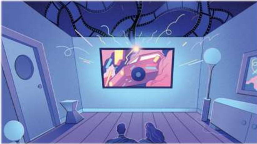
Rune Fisker for Variety