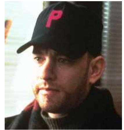
(Click to Play)

On December 14, 1993, the Century Plaza Hotel in Los Angeles hosted the world premiere and benefit screening of Philadelphia , starring Tom Hanks and Denzel Washington and directed by Jonathan Demme. The film broke ground for Hanks' Oscar-winning performance as a gay man afflicted with AIDS and discrimination of the conservative society around him. One week later, the film's theatrical opening came one day after the Clinton administration issued its "Don't Ask Don't Tell" directive, a political compromise intending to provide space for homosexual service members to remain in the military as long as they did not openly declare their sexual orientation. Hollywood has struggled with its own reputation for presenting sanitized versions of reality – see #OscarsSoWhite . However, as attitudes within broader society have changed, it is undeniable that movies have become dramatically more diverse in the stories they tell and the characters they portray. Case in point, Clea DuVall's Happiest Season starring Kristen Stewart is one of Hulu's hottest films of the season, a rom-com about a same-sex couple travelling home for the holidays to meet the family.