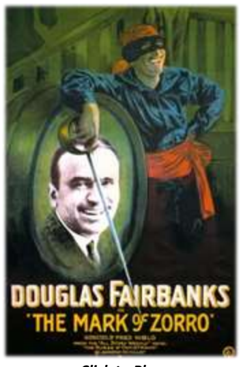
Click to Play