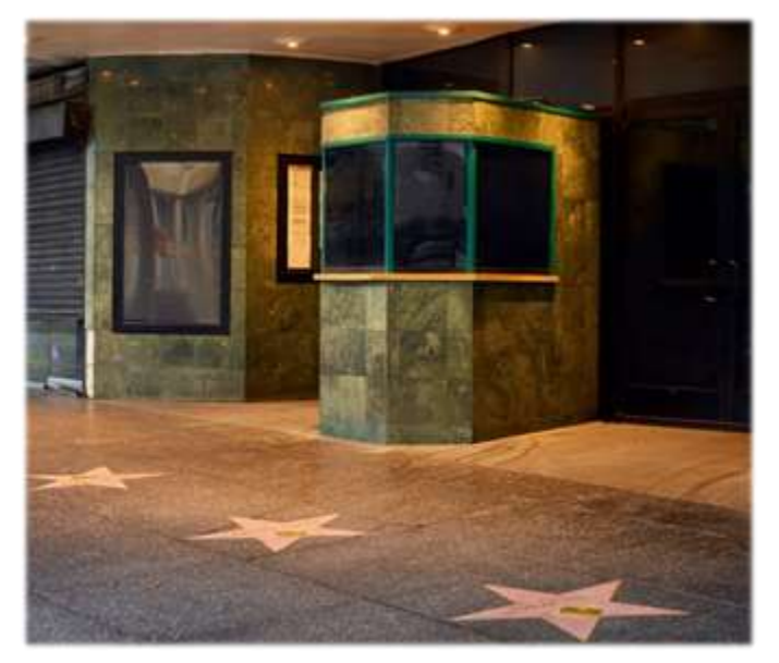
The permanently closed Vine Cinema in Hollywood.

While it requires a certain amount of creativity, modern cineplexes are often located in prime suburban locations, commercially zoned with ample space, high ceilings and advanced HVAC systems. Some developers are converting them into mixed-use developments that integrate retail and office space, apartments and condos and co-working facilities.