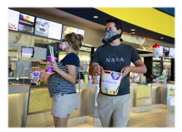
Purchasing popcorn and drinks at Reading Cinemas Grossmont in La Mesa, CA.