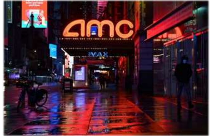
The closed AMC theatre in Times Square

A.O. Scott, the Chief Film Critic of the New York Times, offers his thoughts on the possible future of cinemas, gasping in its struggle with yet another existential crisis. He points out that the theatrical experience for moviegoers has always been uneven, and a return to “how things used to be” is not necessarily the most likely, or best outcome. Perhaps, the appetites of movie lovers can be re-animated with a greater variety of films. “Many of the most interesting films of the past half-decade... have had a hard time finding screens and oxygen...[During the pandemic], in the absence of blockbusters, small, audacious movies have popped up like mushrooms on a forest floor — signs of life amid the general decay, but fragile and too easily overlooked or trampled underfoot.”