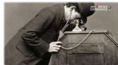
Thomas Edison's Kinetoscope

of images in frames. As the film passed over the light source, a shutter would open and close in rapid succession, illuminating each image to create the illusion of movement. While the technology was interesting, Edison understood that the money would come from distributing films to a public who would pay to see it. Edison dug in to patent suits and other hard-knuckle business tactics in an attempt to control the developing business. In order to escape Edison's reach, Carl Laemmle and other early pioneers of the movie business relocated west, settling eventually in Los Angeles where the weather was near-perfect all year. Founded as Laemmle Film Service, his company eventually was renamed Universal Pictures, which is still making news for its impact on film distribution.