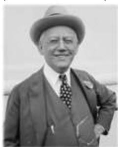
Carl Laemmle, Founder of Universal Pictures

William Dickson gave the first public demonstration of their Kinetoscope, a forerunner of the motion picture projector. Edison's Kinetoscope was a single-person viewing kiosk that presented motion pictures through a peephole. It used rotating sprockets to move a perforated film strip over a light source at a constant rate. The film reel presented a sequence