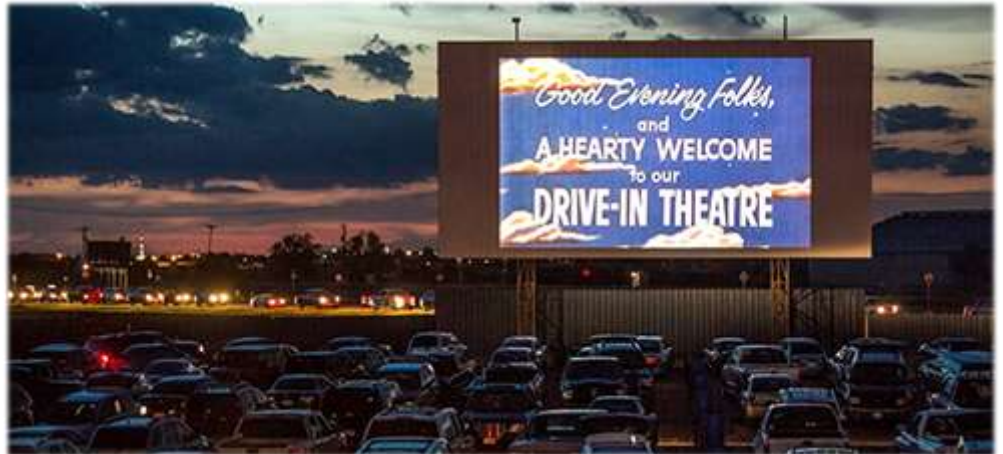
The Stars and Stripes Drive-In located outside Austin TX was the top-grossing theatre in the country last weekend for the opening of 101 Studios' The War with Grandpa

Last weekend's respectable box office of $3.6M for the opening weekend of 101 Studios' family comedy The War with Grandpa was a thin ray of sunlight piercing through the cloudy fall weather for exhibitors. Breaking down those results, the South and Southwest out-performed their historical rankings among US regions, outpacing regions that would be expected to lead the box office in normal times. Phoenix, Dallas, Houston, Austin, Atlanta, Orlando, Salt Lake City and Southern California outside of LA county are all up, whereas New York, Boston, Philadelphia, Washington DC, Chicago, LA, San Francisco and Seattle are all down. Of course, all indoor theatres in New York and LA County remain closed by order of their local health authorities, leaving traditional and pop-up Drive-Ins as the only venues available to taken in these films. In fact, Drive-Ins accounted for 9 of the top 10 grossing theatres for The War with Grandpa , indicating the hesitation the public feels in returning to indoor cinemas.