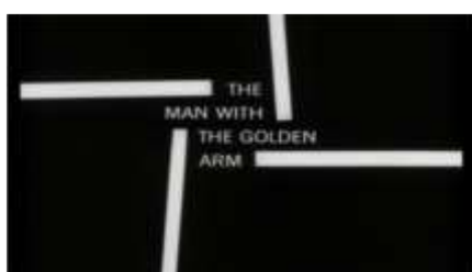
The Man with the Golden Arm (1955) (Click to Play)

Remembering Saul Bass: The Designer Who Changed Cinema