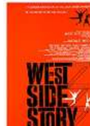
West Side Story (1961)