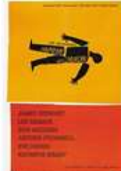
Anatomy of a Murder (1959)