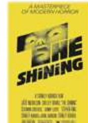
The Shining (1980)