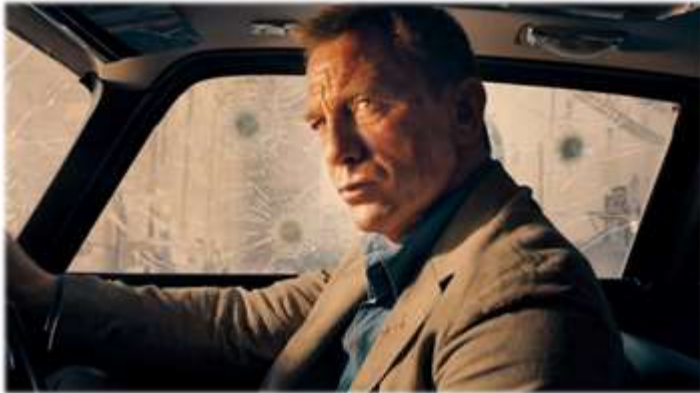
Daniel Craig in his final reprise as James Bond in MGM/UAR/Universal's No Time to Die