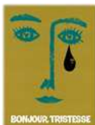
Bonjour Tristesse (1958)