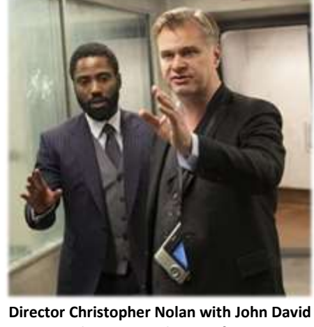
Washington on the set of Tenet

On Friday, Warner Bros. announced its decision to push back the planned 10/2 release of Wonder Woman 1984 to Christmas Day. On the one hand, it's a sober reminder of the halting progress the industry has made in luring audiences back to theatres amidst the ongoing coronavirus pandemic. Last weekend's ticket sales for Tenet were lower than many had hoped for on the opening weekend of the widely-anticipated blockbuster. On the other hand, it's a win of sorts for exhibitors that Warner Bros. has remained steadfast in its commitment to releasing WW1984 to theatres. In Friday's announcement, director Patty Jenkins implored fans to be patient, saying "Because I know how important it is to bring this movie to you on a big screen when all of us can share the experience together, I'm hopeful you won't mind waiting just a little bit longer."