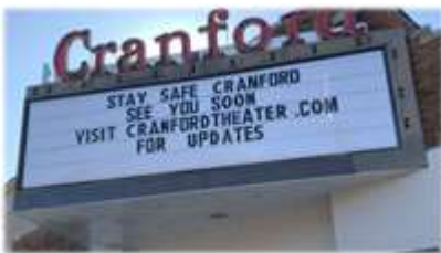
The Cranford Theater in Cranford, NJ

See also: Fall Film Festivals Reinvent Themselves Amid Pandemic (Hollywood Reporter)