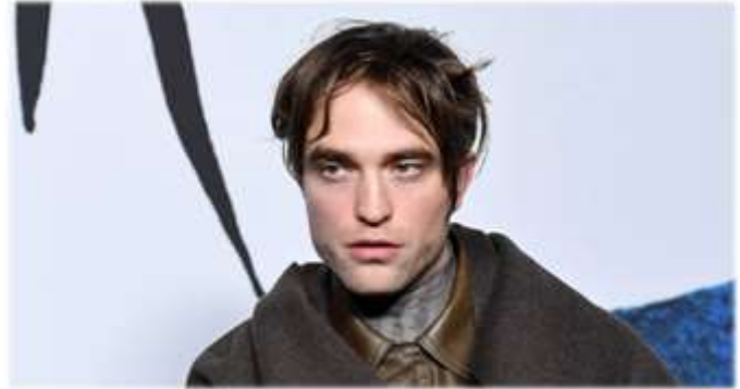
Robert Pattinson stars in The Batman

On Thursday, Vanity Fair broke the story that Warner Bros. was shutting down its filming of The Batman just days after it had resumed due to star Robert Pattinson testing positive for COVID-19. Pattinson has now begun a 14-day quarantine, while production at WB's Leavesden Studios in the U.K sits idle. This is the first instance of a major studio film having been shut back after restarting post-pandemic. Industry watchers are anxious about the implications for other studio productions. "No one wants to admit this can happen to them," said a top industry executive. "Everyone in production is white-knuckling it to get it done. The attitude seems to be, 'I'm sorry it happened to them, but if it doesn't happen to me, that's great.'"