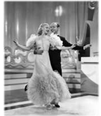
Ginger Rogers in a dress made to twirl in Swing Time - Click to Play

Western Giant starring Rock Hudson, Elizabeth Taylor and James Dean. 34 years later in 1967, Steven's son George Stevens Jr. became the Founding Director of the American Film Institute, and creator of the AFI Lifetime Achievement Award (beginning in 1973) and the producer of the Kennedy Center Honors (beginning in 1978).