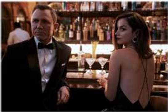
Daniel Craig & Ana de Armas in NO TIME TO DIE

When Coca-Cola bought Columbia Pictures for $800M+ in 1982, Hollywood marketers said shelf life was the big difference between six-packs of soda & movies. Soft drinks could sit on supermarket shelves for months and be marketed with one campaign. But every film was a unique product needing its own costly marketing campaign to find its audience. In the end, Coke did just fine – selling Columbia to Sony in 1989 for $3.4B.