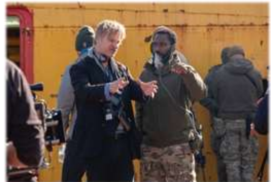
Nolan with John David Washington on the set of TENET

Labor Day's biggest launch was MGM/Dimension's HALLOWEEN reboot 8/31/07 with $30.6M for 4 days (3 days: $26.4M). Unless it rained, Labor Day was the last gasp of summer for people in the East & Mid-