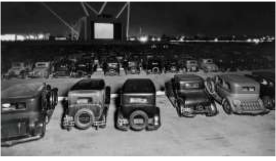
Opening night at LA's Drive-In Theatre (later Pico Drive-In Theatre) on 9/9/1934.

destination, having space to accommodate 487 cars, each of which paid 35 cents each for entrance.