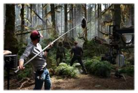
On location, after film re-starts for Universal's Jurassic World: Dominion