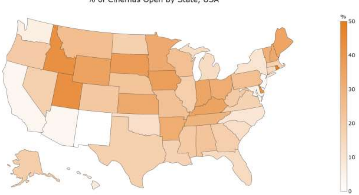
% of Cinemas Open by State, USA

Since early June, the number of theaters open and reporting to Comscore across the Domestic market has more than doubled from 562 on June 6 to 1,224 on August 8. It is undeniable that a big portion of that increase over the past two months has come from returning locations in Canada (approximately 43% of the net gain), and developments in the Canadian part of the Domestic market will form the basis of our focus next week. But the US has also seen growth in both the numbers of theaters open and market share attributable to them. This week we revisit our choropleth graph to see where the most notable changes within the US can be seen.