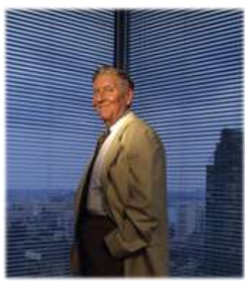
Sumner Redstone at his office in Times Square in 1994

Widespread theatre re-openings are finally at hand, with most US operators re-starting operations over the next two weekends in most locations, timed to coincide with studios releasing key titles: Unhinged opens on 8/21, The New Mutants on 8/28 and Tenet on 9/4. AMC, Cinemark and Alamo Drafthouse all announced details for their re-launch, including creative incentives to entice audiences back to their theaters. They also tout the adoption of enhanced protocols that will ensure health and hygiene at the theatre.