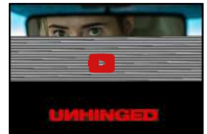
(Click to Play)

The US motion picture exhibition industry is on pins and needles in anticipation of the imminent re-opening of