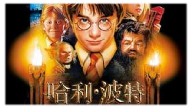
Harry Potter and the Sorcerer's Stone (2001), this Weekend's Box Office Leader in China

'Harry Potter And The Sorcerer's Stone' Nears $1B WW With Magical China Reissue – International Box Office (Deadline) The industry is watching closely the upturn in box office results in worldwide markets, as an indicator for what may be in store for the Domestic market once US theatres have completed their reopening. In China, the world's second largest exhibition market, week-over-week grosses continue to movie upward even with a shortage of new releases. This weekend's highest grossing film was the Warner Bros. re-issue of Harry Potter and the Sorcerer's Stone, the first film in the blockbuster series. This 4K restoration played on 16,000 screens throughout the Middle Kingdom, bringing in $13.6M over the three days, bringing it to a lifetime cumulative box