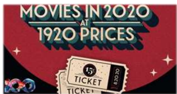
AMC's 15-Cent Movie Tickets, Available on 8/20