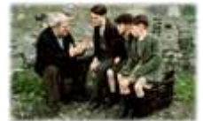
Angela's Ashes (1999)

"People said, 'You must have been so brave!'. I said, 'No, just stupid'"