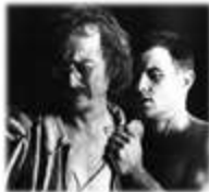
Midnight Express (1978)