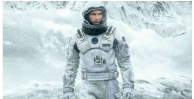
Warner Bros.' Re-Release of Christopher Nolan's Interstellar topped Chinese Box Office this weekend

This report tracks box office results from China, where approximately 60% of cinemas have re-opened in regions deemed to have "low risk" of COVID-19 infections. The second largest global exhibition market is once again showing signs of life, as movie lovers venture back to local cinemas even in advance of major new studio releases. The Sunday debut of Christopher Nolan's 2014 Sci-fi thriller Interstellar produced $2.85M in ticket sales, the single largest opening day results for any film released in China since theatres there were closed in late January. On Saturday, the local box office produced $5.74M, led by Universal's Dolittle and The Enigma of Arrival , a Chinese studio production. It's enjoyable to have the opportunity to break down even these modest results from China, perhaps a sign of a return to movie-going in the Domestic market. See also: Some China Cinemas to Schedule Intermission for Films Over Two Hours Long (Variety)