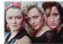
The Commitments (1991)