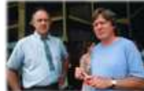
Mississippi Burning (1988)