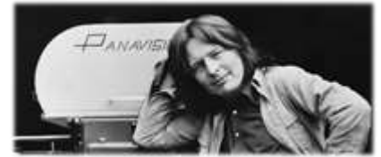
Alan Parker (1944 - 2020)

God speed and fond remembrances to British filmmaker Alan Parker , who died on Friday at the age of 76. Parker made 15 features over his 25-year career from the mid-1970s through the early-2000's. He demonstrated unmatched range in style and subject matter in his films, spanning a G-rated musical Bugsy Malone (1976) featuring an all children's cast to the nearly X-rated voodoo horror film Angel Heart (1987) starring Mickey Rourke and Robert DeNiro. The thread throughout Parker's films was that they were riveting, memorable and enjoyable creations.