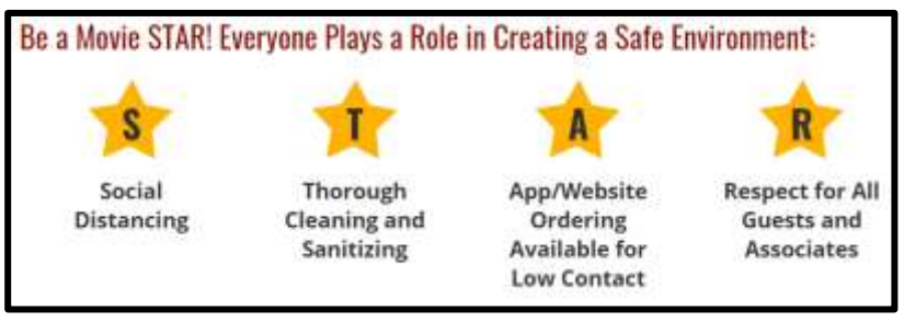
Be a Movie Star – Tips offered by Marcus Theatres on how moviegoers can support a safe and healthy environment at the theatre.

There was slow but steady progress this week towards exhibitors reopening theatres. Marcus, the fourth largest exhibitor in the US, announced that it would reopen six of their 90 locations on Friday, 6/19. Programming during these initial weeks after the reopening will consist of the same fare that most drive-ins are screening, a combination of classics such as Jaws, Back to the