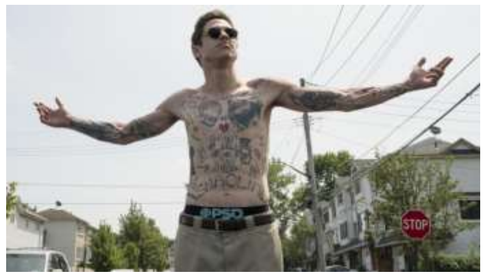
Pete Davidson stars in The King of Staten Island (Universal)