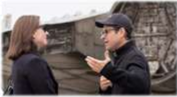
On Set with J. J. Abrams during filming of Star Wars: Episode VII— The Force Awakens (2014)

Kevin Fiege and Steven Spielberg. Kennedy's highlighted film credits include E.T. , the Indiana Jones , Back to the Future and Jurassic Park series, Schindler's List , The Color Purple , Lincoln , and the last 5 Star Wars films as well as The Mandalorian now streaming on Disney+.