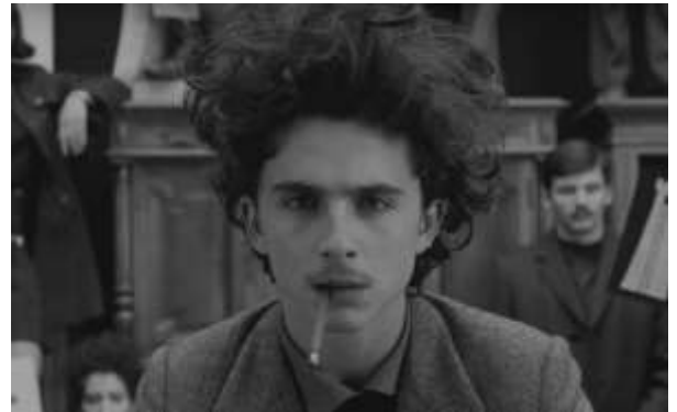
The French Dispatch (Searchlight Pictures) is one of 56 films chosen as Cannes 2020 Official Selections