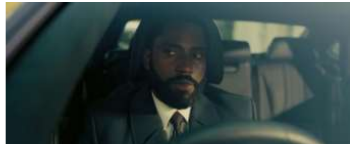
John David Washington stars in Christopher Nolan's spy thriller Tenet (Warner Bros.), opening 7/17

All indications are that Warner Bros. will follow through with their planned July 17 th release date for the Christopher Nolan spy thriller Tenet . WB execs have stated that they will need at least 80% of US theatres to be open by that time for the much-anticipated, big-budget production to have a chance to turn a profit. Early in the week, NATO announced that it expects fully 90% of domestic theatres to be open by the mid-summer date. A few days after the statement from NATO, Warner Bros. released its Inverted Trailer , the latest in a series to drive interest in the film in the run up to its debut.