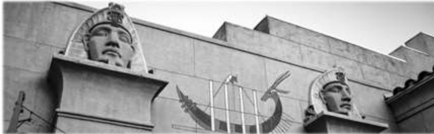
The Egyptian Theatre in Hollywood, CA

Last year, Netflix made headlines when it announced a 10-year lease to operate the Paris Theater, New York's iconic movie house which had recently closed down due to the challenging financials of running a single-screen art house theatre in pricey mid-town Manhattan. This Thursday, the Titan of Streaming doubled down on its foray into exhibition by announcing it had joined with American Cinematheque as a new co-owner of Hollywood's Egyptian Theatre. Under this arrangement, American Cinematheque will continue to program the theatre on Friday, Saturday and Sunday while