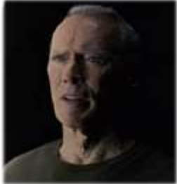
Million Dollar Baby (2005)

A very happy 90 th birthday to Clint Eastwood , born on 5/31/1930. Over a career spanning six decades, Eastwood has starred in and directed a bounty of Hollywood's most memorable films. He first rose to fame in the 1960's starring as "The Man with No Name" in a trilogy of Sergio Leone-directed Spaghetti Westerns, most notably The Good, The Bad and the Ugly (1966) which is considered by many as the pinnacle of the genre. In the 1970's Eastwood played