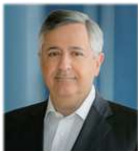
Tony Vinciguerra CEO of Sony Pictures

2) face masks, 3) temperature checks when entering the building, 4) seating assignments that maintain safe, social distance between patrons and 5) frequent cleaning of high-touch surfaces. While implementing all of these procedures is burdensome, numerous consumer surveys show that the key to a successful re-opening is re-establishing public confidence that movie-going is a safe activity.