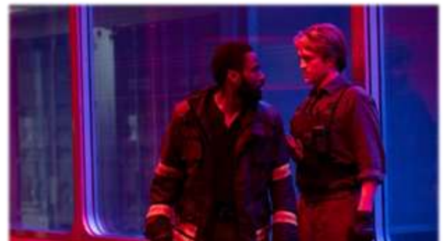
John David Washington and Robert Pattinson star in Tenet , Opening in Theatres on 7/17