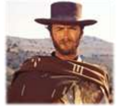
The Good, the Bad and the Ugly (1966)

Detective Harry Callahan in the Dirty Harry cop vigilante series, which turned him into household name and cultural meme – "Go ahead, make my day." In his early 40's, Eastwood began working as a filmmaker and developed his following for strong character portrayals. He returned to Westerns with Pale Rider (1985) and Unforgiven (1992), earning him his first Oscars (for Best Director and Best Picture). Eastwood's work has continued to evolve in the decades since, with acclaimed films including Mystic River (2003), Million Dollar Baby (2004), Gran Torino (2008) and American Sniper (2014). On the occasion of receiving a National Medal of Arts award, his films were praised as "essays in individuality, hard truths and the essence of what it means to be American."