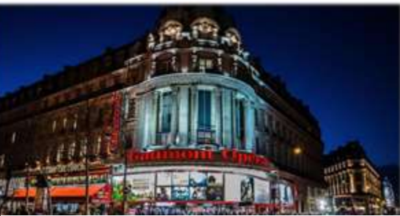
Gaumont Opera Movie Theater in Paris, France

UK-based Cineworld, the parent company of Regal Cinemas, announced its plans to re-open theatres in July, timed to be fully up and running by mid-month when the summer crop of new Hollywood releases arrives. Cineworld also announced it had secured additional loans and liquidity from investors to help it bridge the gap until audiences and profitability return. In a related story,