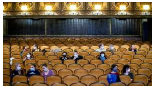
At the movies in Prague, Czech Republic

This deep-dive lays out the many operational changes that are being implemented in preparation for re-opening cinemas this summer. Exhibitors are faced with meeting the dual goals of ensuring the health and safety of both the public and staff while providing a fun and welcoming environment to attracts an audience. On the menu are: 1) contactless ticketing and check-in,