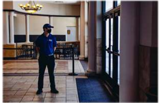
A masked staff member welcomes guests at the Santikos Palladium IMAX in San Antonio, TX

See also: Survey Says Most Moviegoers Will Return to Theaters If Safety Rules Are Enforced (MovieWeb)