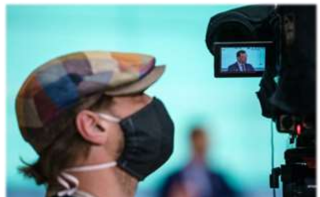
A cameraman on set wearing a protective face mask

The pace is picking up in detailed planning for how Hollywood can safely re-start production. An industry task force has created a preliminary draft of a report entitled “Hollywood Safety White Paper”, drilling down on recommended procedures for operating a production set in the age of COVID-19. The report incorporates the perspectives of key constituents including studios and guilds with input from medical professionals. One key audience for the report are the governors of US states which are major hubs for film and TV production. These governors hold the keys for deciding when and how all business, sporting and social activities will resume in their states. Recommendations include the goal of limiting the number of people who participate in on-set activities, testing cast and crew for COVID-19 infections prior to shooting and ongoing education and monitoring of the safety protocols on set. While these recommendations are still provisional, the mere fact that they are being drafted and negotiated represents an important step on the path to reopening production.