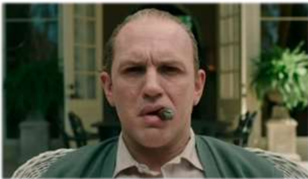
Tom Hardy stars in Capone (Vertical Entertainment)

The early take from $9.99 VOD rentals for Josh Trank’s Capone were solid, generating $2.5 million over its first 10 days.