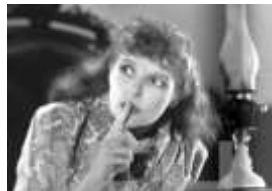
Little Women (1933)

We honor the film career of Katherine Hepburn to celebrate of her 113 th birthday on Tuesday May 12 th . She was born into a New England family of culture, if not wealth, and attended Bryn Mawr College outside Philadelphia where she fell in love with acting. After graduating in 1928, she began acting on stage in New York where she caught the attention of Hollywood producers. Over a film career that spanned more than 60 years, she starred in