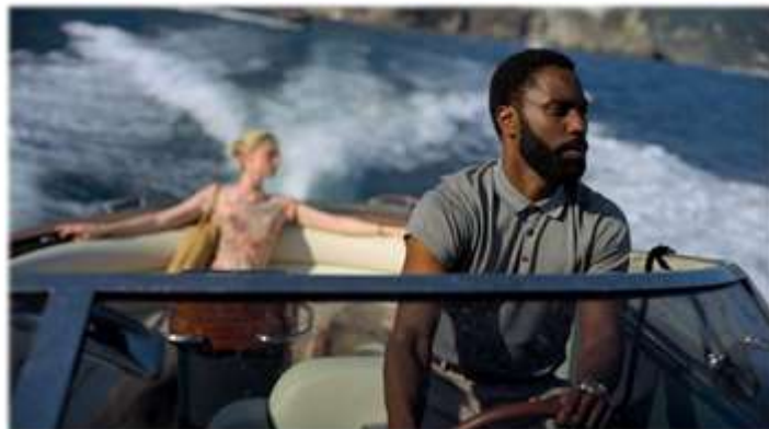
Warner Bros. release of Christopher Nolan's Tenet is scheduled for 7/17

Warner Bros. has scheduled the worldwide theatrical release of Tenet on July 17 th .