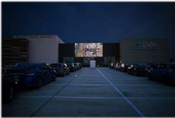
Evo Entertainment Operates Pop-up Drive-ins at their Schertz and Kyle TX Locations