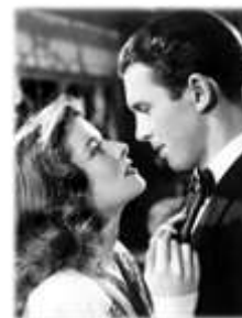
Philadelphia Story (1940)