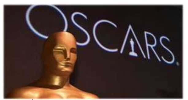
The 93<sup>rd</sup> Academy Awards will be held in Los Angeles on February 28, 2021

See also: The Movie Theater Industry Can't Afford the Fight AMC Just Picked (The Motley Fool)