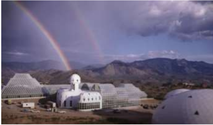
Neon's Spaceship Earth will premiere on-line as a Virtual Cinema release, with a portion of the box office going to fund local theaters.