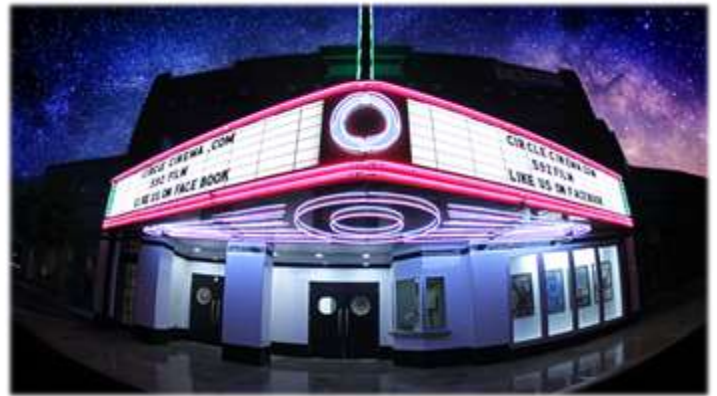
Circle Cinema in Tulsa, OK