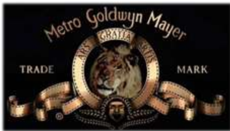
Production: ‘We’re Planning the Re-Entry Period’ (Variety)

The coronavirus pandemic has forced studios to reduce costs as they attempt to navigate their way through the storm. In many cases, cost reductions have focused on staff and salary expense, resulting in a painful cocktail of pay cuts, furloughs and layoffs. Last week, MGM announced its plans to eliminate 50 positions from its team of 750 employees. Distribution joint venture Annapurna/United Artists Releasing furloughed one third of its marketing and distribution staff, with hope that most will be able to return to their positions later in the summer once theatres have re-opened. Even prior to the current crisis, MGM and UA Releasing were skating on thin ice, so it’s expected that they would have to act swiftly in the face of the shutdown to reduce their expenses. See also: California Film Commissioner Colleen Bell on Resuming