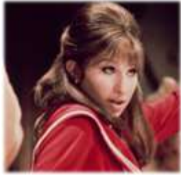
(Click to Play)

For Exhibitors About Films, the Film Industry and Cinema Advertising