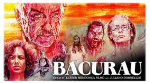
Bacurau (Kino Lorber), now streaming on-line with proceeds to benefit a theatre near you. (Click for More Information)