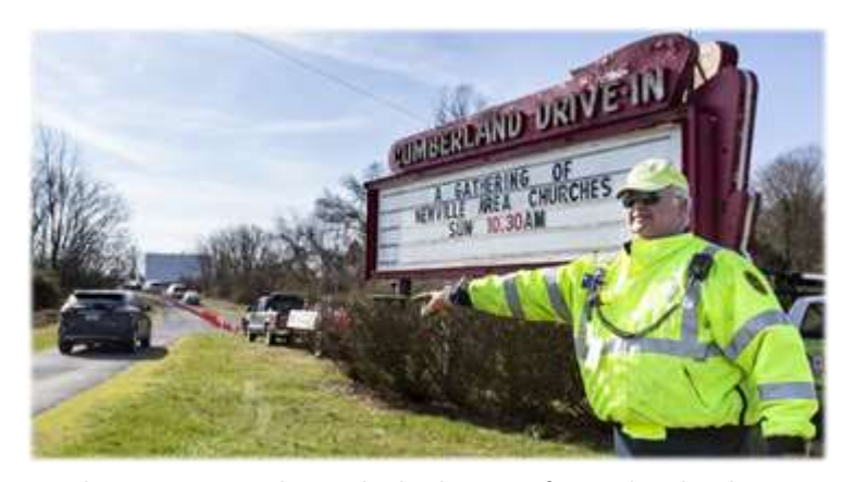
Parishioners Arrive at the Cumberland Drive-In for Sunday Church Service

<u>Churches will have Easter Services at the [Big Sky] Drive-In (Midland Reporter-Telegram)</u>